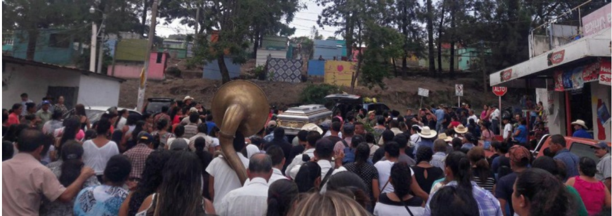
Figure 1 27

mine, 25 the criminalization and detention of its leaders 26 and Tahoe's denial of the existence of Xinka people.